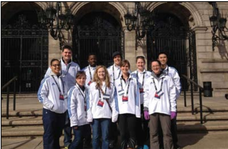
Members of Temple Podiatry’s Sports Medicine Club wearing their Boston Athletic Association medical jackets in Boston before the race.

“I think having been in medical school for four years, nothing can prepare you for that emotionally, but you to turn into a focused physician when the time comes,” he said. “What you’re taught, you use to the best of your ability.” ♦